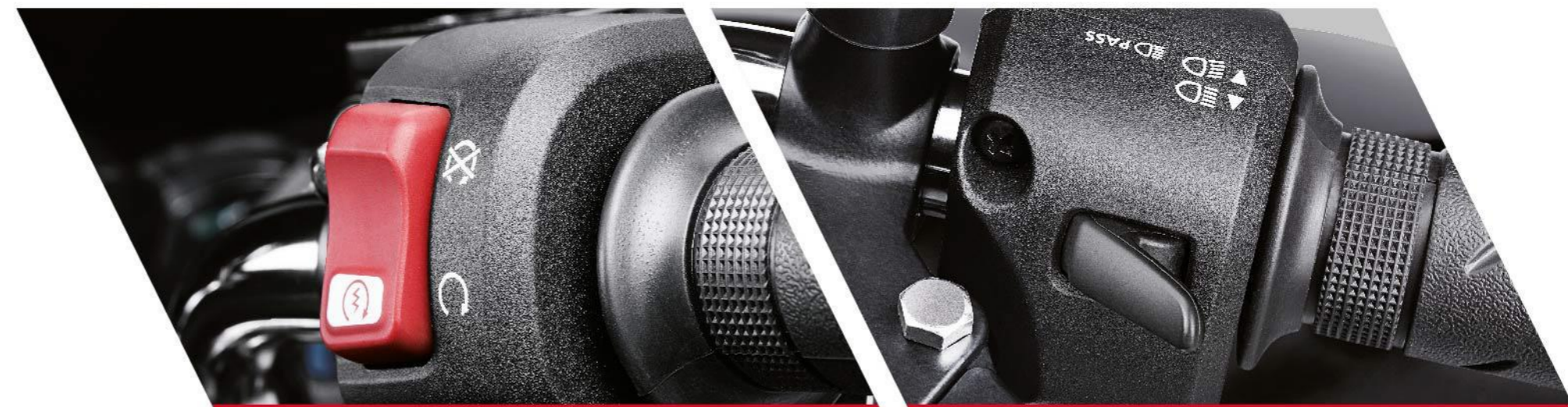
ENGINE START/STOP SWITCH

The DC Headlamp gives consistent illumination while riding, irrespective of the speed and riding conditions.