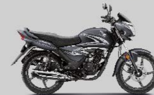
MATTE AXIS GREY